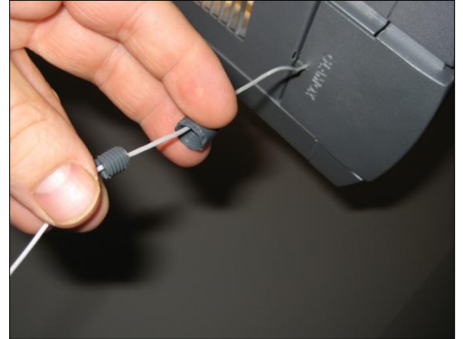
Pull the nylon cord through the top of the "housing" and the centre of the locking screw