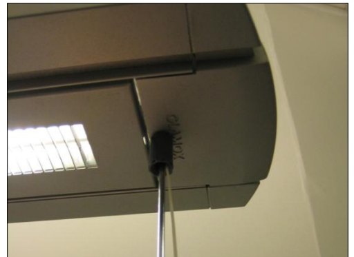
Completely fasten the locking screw to the "housing"