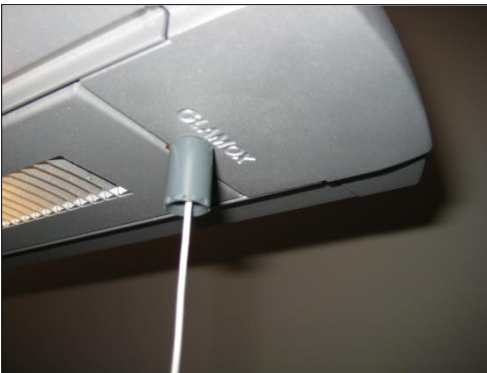
Before tightening the screw completely, slide the "housing" towards the luminaire chassis, and make sure it's plane