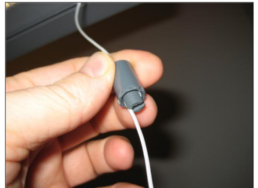
Insert locking screw into the "housing", and tighten slightly with a screwdriver